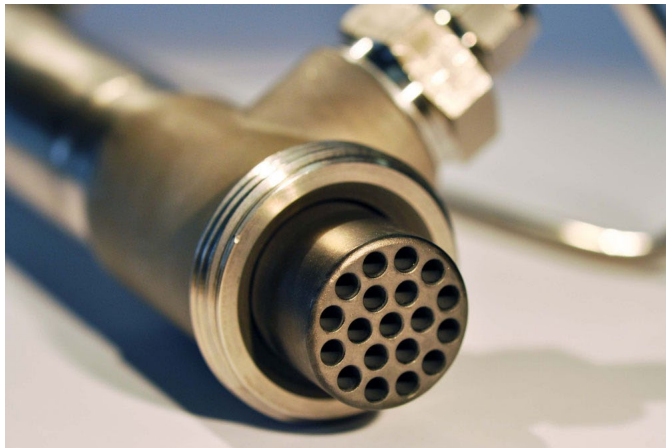
Fig. 1 The 19 channels in the carbon membrane enlarge its surface area, and this in turns encourages a higher substance throughput.