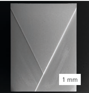
Figure 1: SEM image of a 3Y-TZP ceramic.

Figure 2: SEM image of a broken chevron notch.