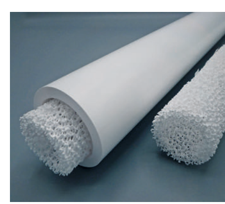
Foam ceramics membrane compound in tubular design.