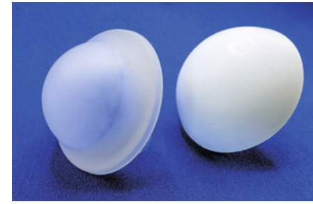
Complex curved MgAl_2O_4 ceramic with different wall thicknesses (left) and curved Al_2O_3 ceramic (right).