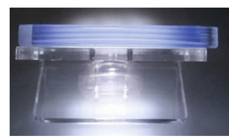
Multilayer gelcasting (MgAl<sub>2</sub>O<sub>4</sub>) of transparent ceramics with alternating doping with and without cobalt.