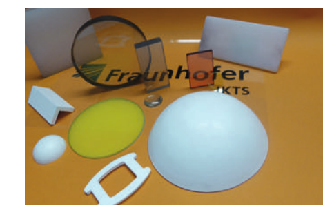
Ceramic parts with high shape variability produced by gelcasting.