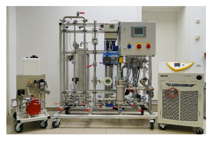
Pilot plant used for field testing, built by Fraunhofer IKTS.