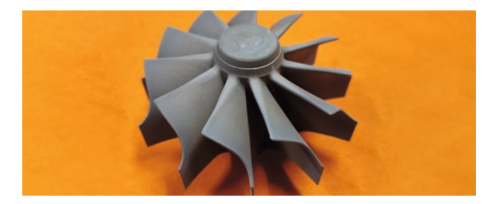
Figure 1: Sintered silicon nitride turbine wheel.

Even as early as during the selection and preparation of raw materials, it is possible to impact specific costs. When preparing raw materials in the form of mixed milling for comminution and mixing using sinter additives and subsequent binder-free granulation, ball milling processes with subsequent aqueous spray granulation are used. Optimizing raw material selection and milling conditions (batch size, milling balls, filling) can help reduce costs considerably through shorter milling processes and savings in energy consumed as well as operating resources.