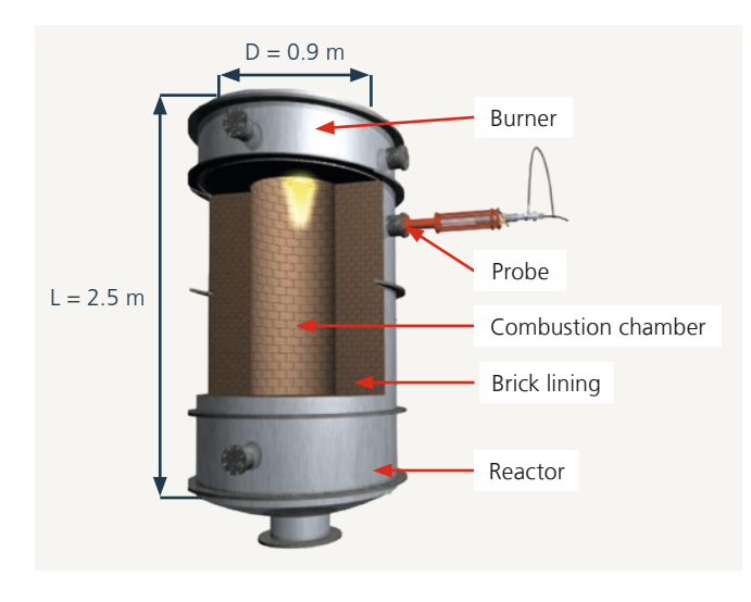
Figure 1: Multi-feed test rig with optical probe system (red).

The experimental reference data for these models results from measurement campaigns using the multi-feed test facility operated at the TU Bergakademie Freiberg. An optical probe enables in-situ flame measurements. The optical tools were developed by measuring the flames of various gaseous, liquid and solid feed materials with a high-speed camera working at a frame rate of 1000 Hz.