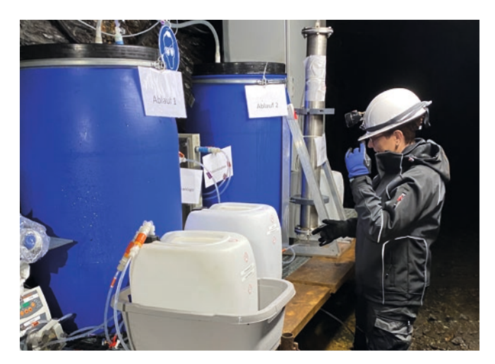
Figure 2: Underground testing facility.

With the underground technical center, IKTS now has another unique research infrastructure. A follow-up pilot project has already been approved.